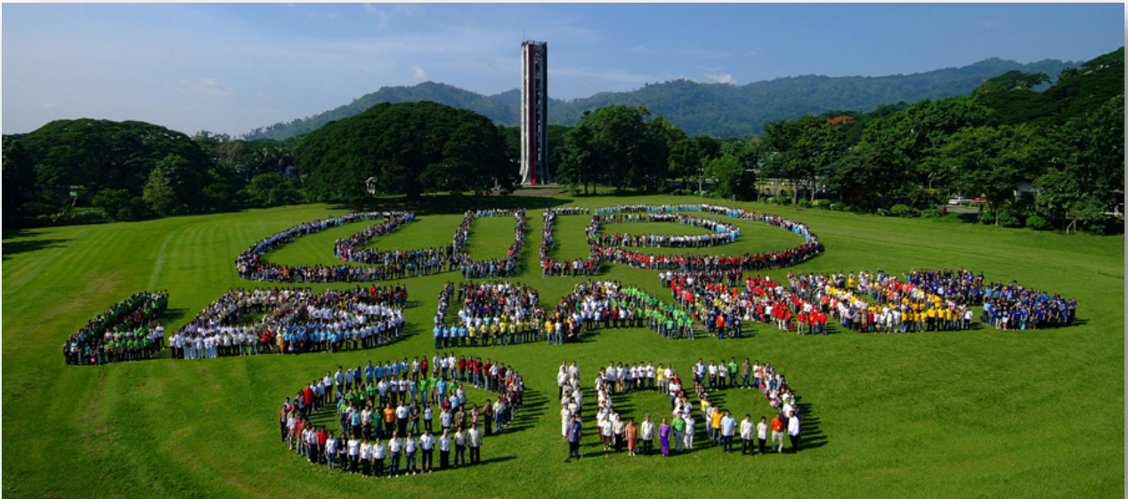
University of the Philippines Los Baños, Laguna, Philippines