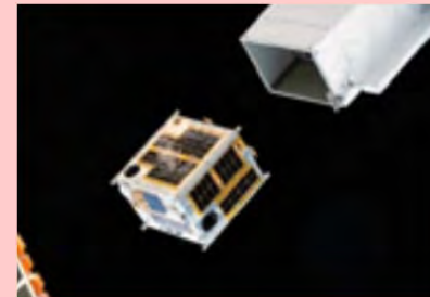
Deployment of Philippine microsat from ISS/Kibo