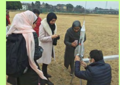
Cansat/model rocket program