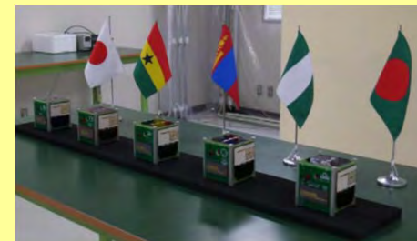
Cubesats developed by students from Bangladesh, Ghana, Mongolia, Nigeria and Japan